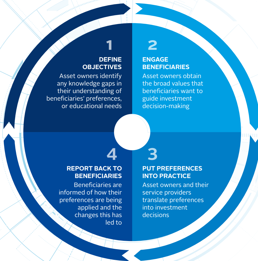
Figure 2: The virtuous cycle of beneficiary engagement

This section sets out the main methods for building an understanding of beneficiary preferences and how these preferences can be incorporated into investment practices.