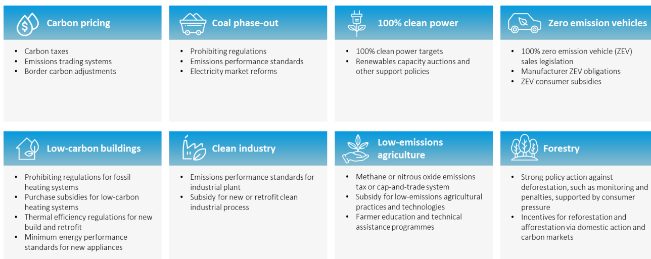
Figure 2 IPR2021 forecasts higher policy ambition across eight key policy levers

In terms of the major policy levers we have looked at, our expectations remain for widespread action: