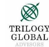
Trilogy Global Advisors, LP